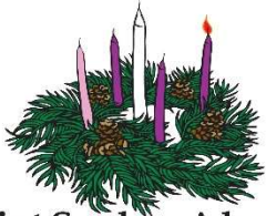
First Sunday of Advent

Today, is the first Sunday in the preparatory season leading us to the celebration of the Nativity of our Lord Jesus. Today we light the candle of "Hope." For four Sundays on our journey, we will light a special candle every week until we reach Christmas Eve/Day when we light the "Christ Candle". The Christmas season lasts for twelve days. Candles: (1) Hope (2) Peace (3) Joy and (4) Love. We have a special Advent daily devotional booklet available free of charge this morning and we hope you will read it every day during this special season. If you are not able to get to the church building, please call 301-351-6689 and we will deliver one to you. Our Pastor wants everyone to have a copy.