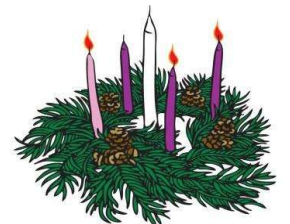
Third Sunday of Advent

One of our favorite Christmas hymns declares, "Joy to the world, the Lord is come." The "joy" we celebrate is an inner, unshakable joy rooted in our faith—a joy so profound that nothing can separate us from the love of God. This true joy gives us the strength to navigate life's dark moments and face challenging situations with resilience and hope. We invite you to worship with us and deepen your faith by reading your daily devotional guide each day. Let's walk this journey of joy together!