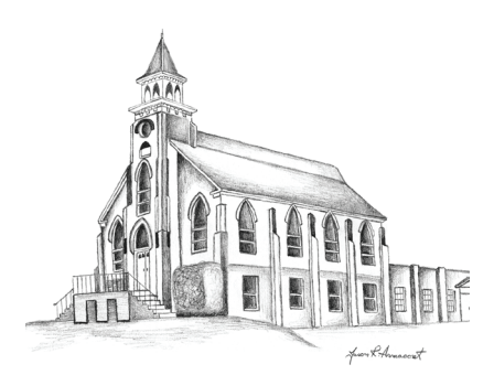
Our Jan.-Feb. 2023 Newsletter!

3006 Old Westminster Pike P. O. Box 511 Finksburg, MD 21048